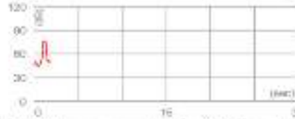
Figure 5. Histogram pronunciation digit 1 normal voice

Pronunciation of digit 1 by a normal voice.