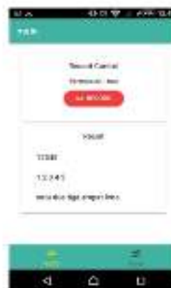
Figure 4: Output View