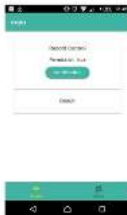
Figure 3: Main Menu

As shown in Figure 3, once the user presses the "record" button then the user is asked to input the sound (voice) or to stop the input word (voice) the user presses the stop button. After the user records the voice (voice input), the application will send the voice input (data) to the Google Cloud. After processing the data on Google Cloud then the input voice will be converted to text and displayed on the device (Android), as in Figure 4.