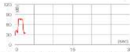
Figure 6. Histogram Pronunciation of digit 1 by a speech impaired voice