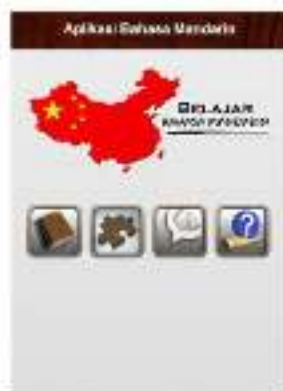
Figure 2. Start of the Application page

When the application starts up, the user will see the app start page as follows: