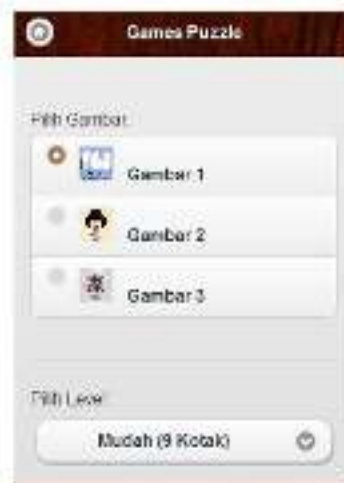
Figure 12. The Puzzle Game of Mandarin Learning

The game model is a modification of the existing game in the computer program, but the content is tailored to the Mandarin material. The game provided is a Puzzle game with material composing pictures of people, shapes and numbers / Mandarin characters. The game is also divided into levels of easy, medium and difficult.