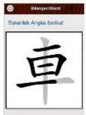
Figure 10. The Sixth Step of Mandarin Letter Writing