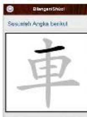
Figure 7. The First Step of Mandarin Letter Writing