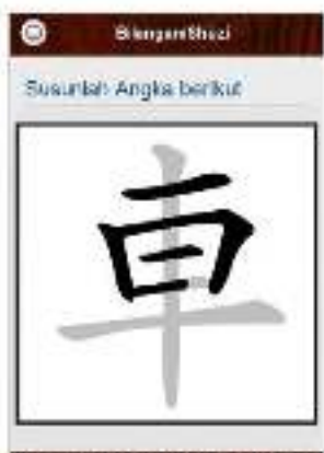
Figure 9. The Fifth Step of Mandarin Letter Writing