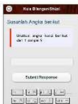
Figure 4. Quiz Page of Composing Sentences

In Figures 3 and 4, the user is asked to do quiz questions and the application will give feedback in the form of wrong or correct. If the user answers correctly the practice question then the application will proceed to the next question. If the user is wrong in answering, then the exercise question will be repeated or the user can request the application to display the correct answer.