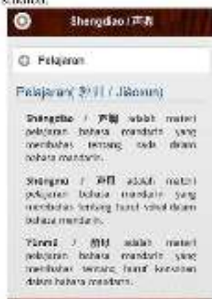
Figure 5. Study Material Choices

The model in this app begins with the user selecting the material being studied.