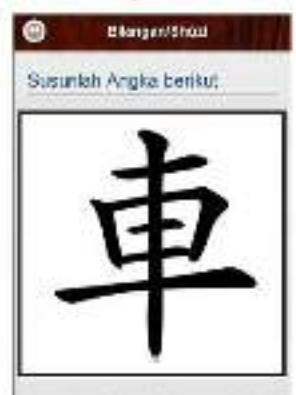
Figure 11. The Last Step of Mandarin Letter Writing