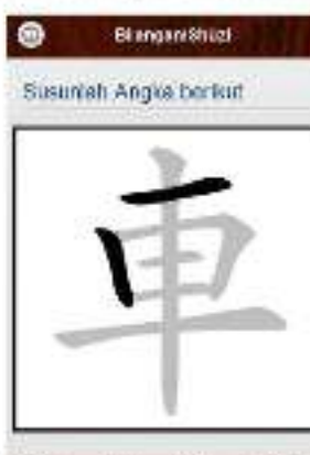
Figure 8. The Second Step of Mandarin Letter Writing