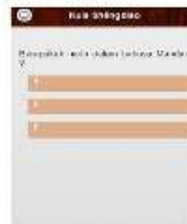
Figure 3. Quiz Page of Multiple Choice

Implementation of CAI Drills-&Practices in Mandarin applications is with Quiz features in each subject matter. The quiz feature is tailored to the terms of the drills-&-practices model is to present problems in the form of exercise questions.