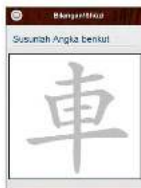
Figure 6. The Homepage of Mandarin Letter Writing

The simulation model of this application on Mandarin writing material. The following is a simulated example of Mandarin letter writing. Users can practice and repeat how to write Mandarin characters.