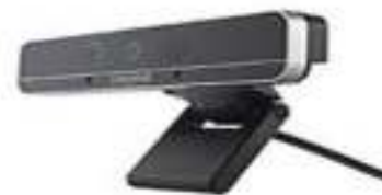
Picture2. 2. Intel RealSense