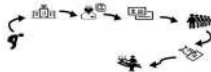
Picture 3.2. Analysis of Current System

On systems running today someone who wants to check the level of fatigue should see a doctor beforehand and be checked by a physician directly to find out how much fatigue that happened to him.