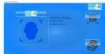
Picture. 2. Main Display