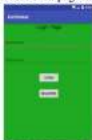
Fig. 7. Log display on Application Featuring an electric monitoring.

On the login page, there are buttons login and register. And at the register to create a new account for login. Without any user account can not access each page monitoring.