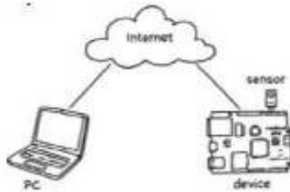
Fig. 2. A personal computer connected via the internet[2]

In the magazine IEEE (Institute of Electrical and Electronics Engineers) declare Internet of Things is a framework in which all have representation and presence on the internet. More specifically, the Internet of Things aims at offering new applications and communication services machine to machine (M2M), which is a communication that enables interaction Things and applications on a cloud definition of Internet of Things, according to the Oxford dictionary is interconnected via the Internet from devices embedded in everyday objects. Allow they send and receive data.