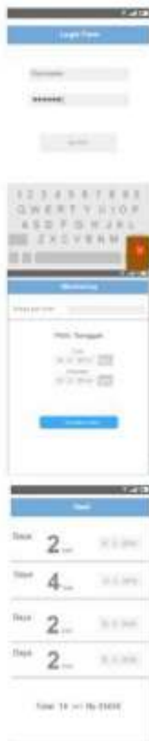
Fig 5. User Interface Design

In the next phase, the authors undertake the design of the user interface system. This design is done on every page contained in a android based system (Fig. 5).