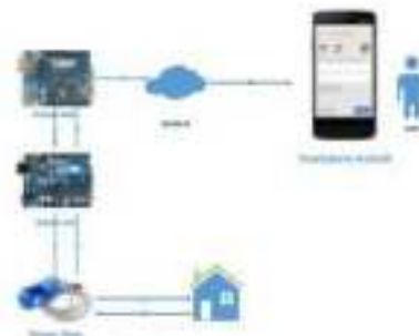
Fig. 3. Proposed System

After that, the authors analyze the current system and the proposed system that we recommend to control the rooming house owner needs Adelina.