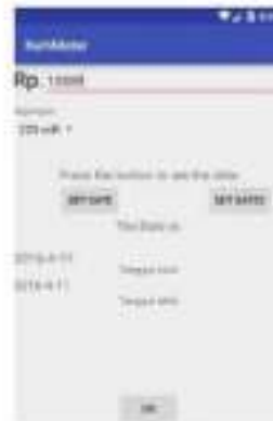
Figure 8. Monitoring view on Application

On this page no input monitoring existing price from PLN. And pick a date that will be displayed data At IDR, user fill unit price Kwh. That price is set by PLN for the current unit. Next on the SET DATE and SET DATE2 a range of uses electricity from date and to date is monitored. Once on the set date next press the GO button.