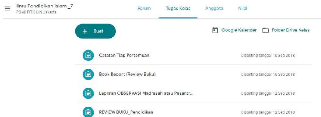
Figure 1. The activeness of students in fulfilling lecture assignments

expected that students can represent what has been said by the lecturer so that what the lecturer can convey can be understood by students. According to cognitive theory, what is seen, heard and recorded by someone will be remembered more than just being heard. Each student meeting has an individual responsibility to record what is conveyed during lectures. Book report (book review), students are expected to have one book that is truly mastered. The weakness of our students at the moment is lazy in reading, with the existence of this task it is hoped that it can foster the habits of students to get used to reading.